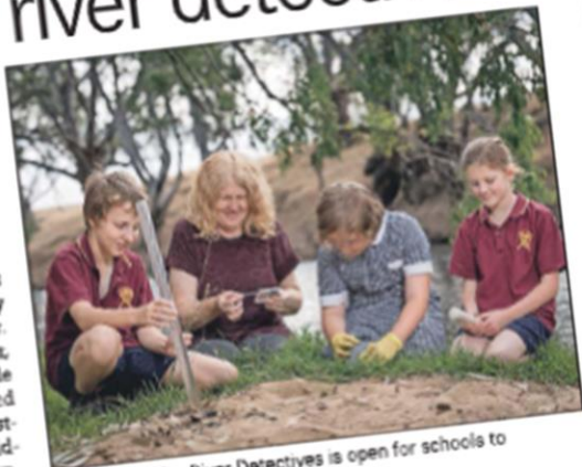
New skills: The River Detectives is open for schools to participate again.

"It enables students to gain an intimate knowledge and