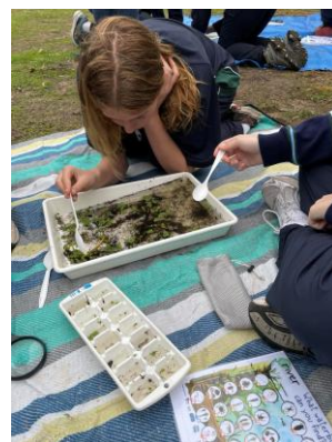
Covenant College students complete water quality testing and macroinvertebrate sampling to assess the health of Moorabool River.