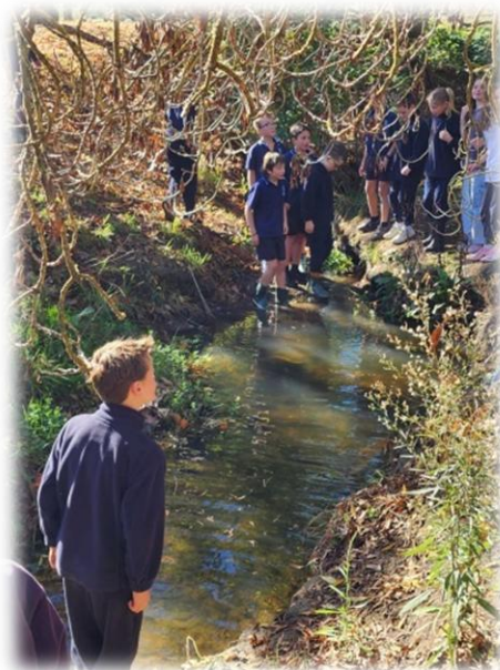
ECPS students exploring their local monitoring site