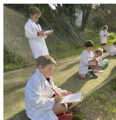
Year 1/2 students at Curdies River tributary, Power Creek