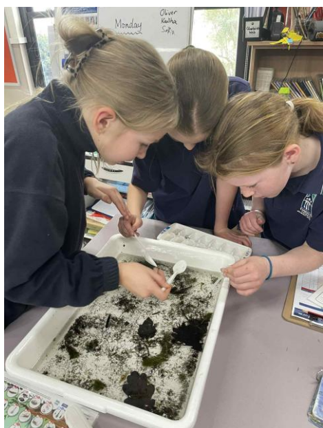
Exploring the wonderful world of water bugs

“These moments capture the spirit of learning, discovery, and stewardship that this program inspires in our school community.”