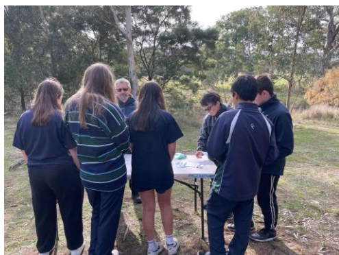
BFS Landcare members with Covenant College Year 9 students

The River Detectives program not only teaches students about water science but also emphasises the importance of environmental stewardship.