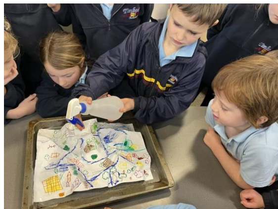
Year 1/2 students learn how catchments work.

"Under guidance from the art teacher they brought the Rainbow Serpent to life, just like the Curdies River after a good soak."