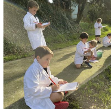
Year 1/2 students at Curdies River tributary, Power Creek