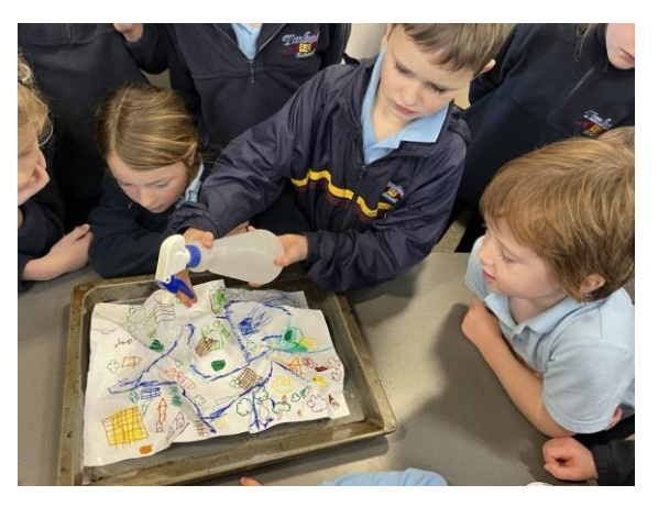
Year 1/2 students learn how catchments work.

"Under guidance from the art teacher they brought the Rainbow Serpent to life, just like the Curdies River after a good soak."