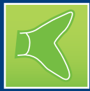
Tail fin shape